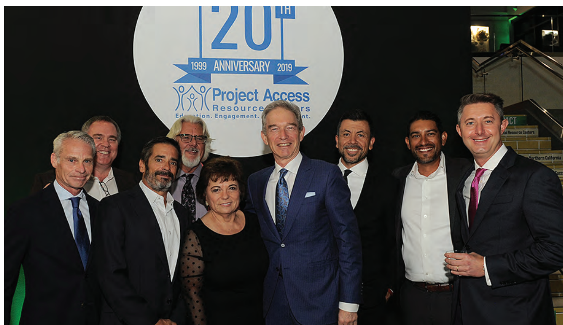
Project Access' board of directors at the Keys to Success gala celebrating 20 years of service to children, families, and seniors living in affordable housing communities.