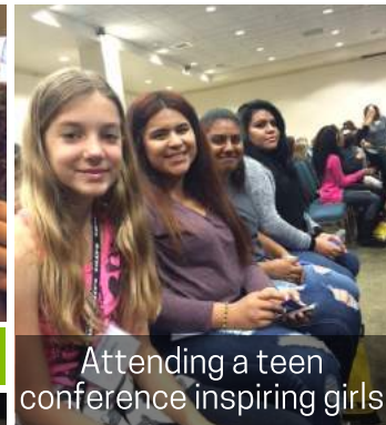
Attending a teen conference inspiring girls