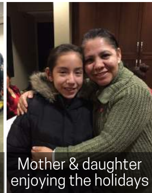
Mother & daughter enjoying the holidays