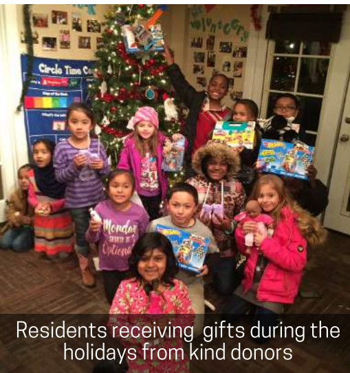
Residents receiving gifts during the holidays from kind donors