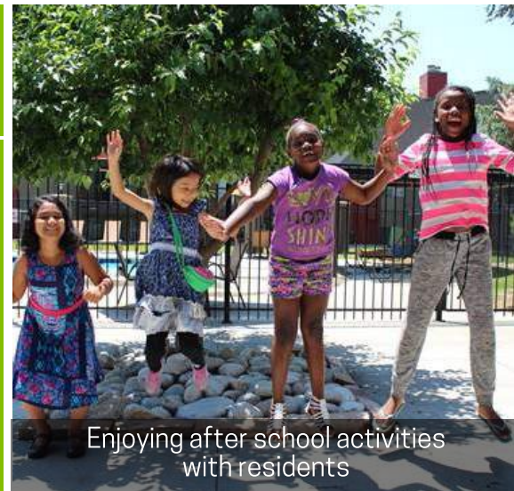
Enjoying after school activities with residents