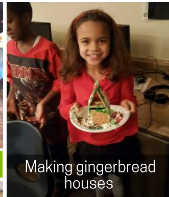
Making gingerbread houses