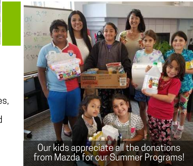
Our kids appreciate all the donations from Mazda for our Summer Programs!