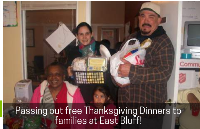
Passing out free Thanksgiving Dinners to families at East Bluff!