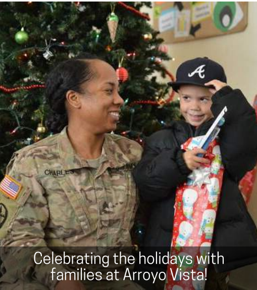
Celebrating the holidays with families at Arroyo Vista!