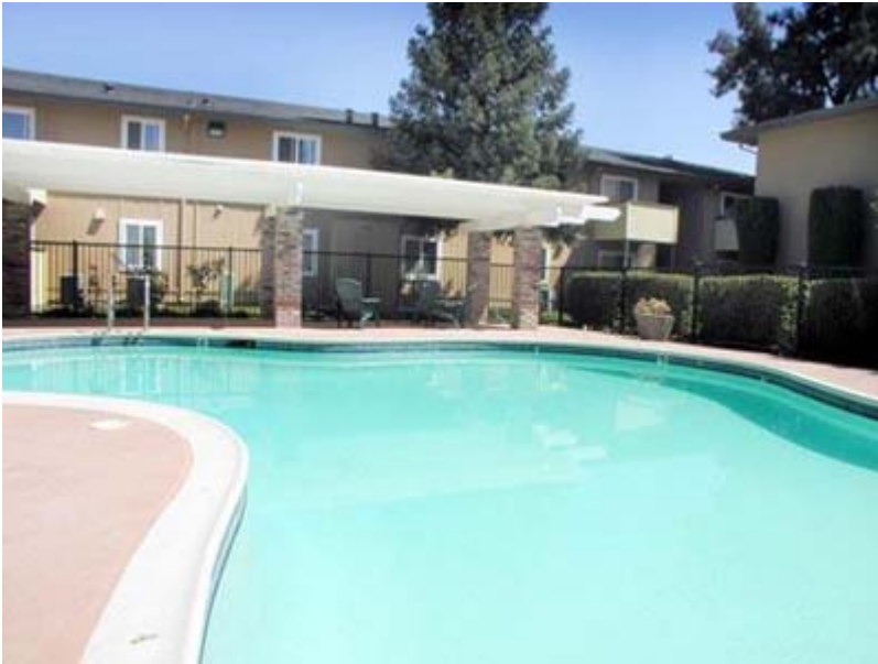
Azure Park Apartments

We are excited to announce that the Project Access Family Resource Center at Azure Park Apartments, a 216-unit affordable housing complex owned by AF Evans in Sacramento, opened its doors on Monday, June 2, 2008. The programs and services will focus on after-school programs for youth, job search assistance for adults, and making available access to Internet connected computers for both youth and adults in supervised computer labs. In addition, Project Access staff will conduct a needs assessment in the community to identify additional service needs and resources the residents living there might need, and will do their best to bring onsite and/or direct clients offsite to get access to these needed services. We look forward to providing services to all of our new clients in Sacramento!